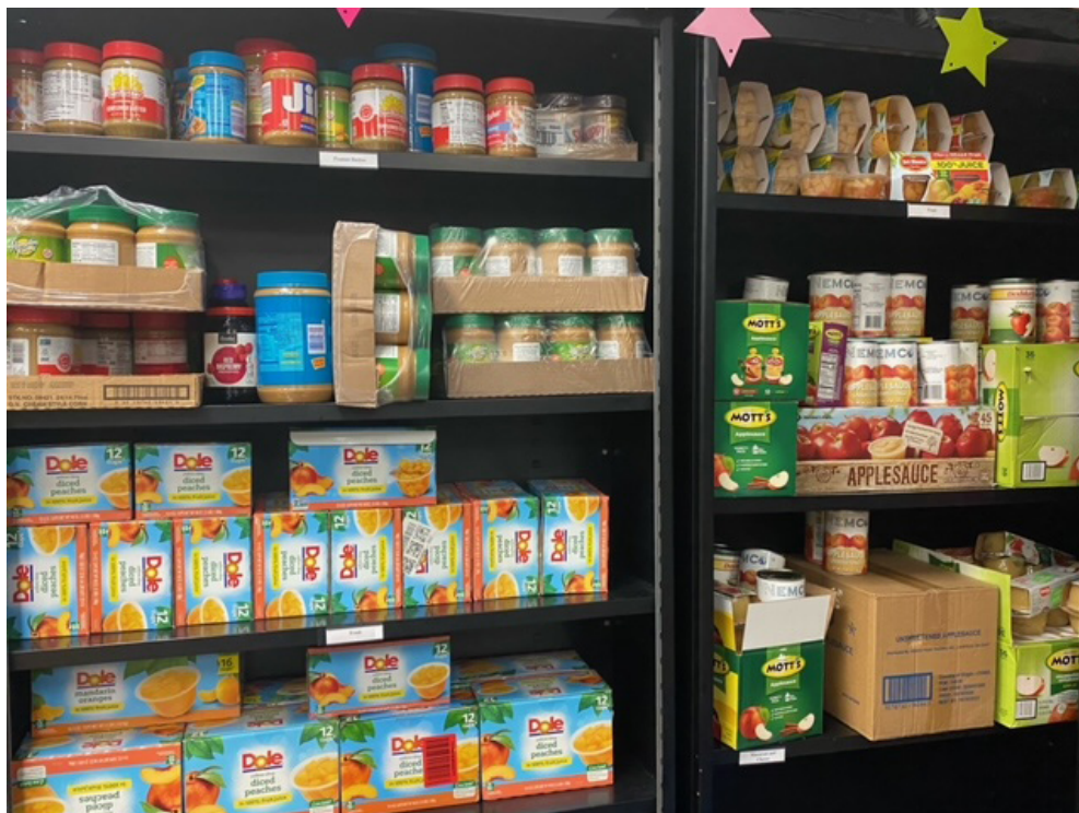
Results from the Retriever Essential food drive.

If you would like to donate to Retriever Essentials, check out their website for information: https://retrieveressentials.umbc.edu/