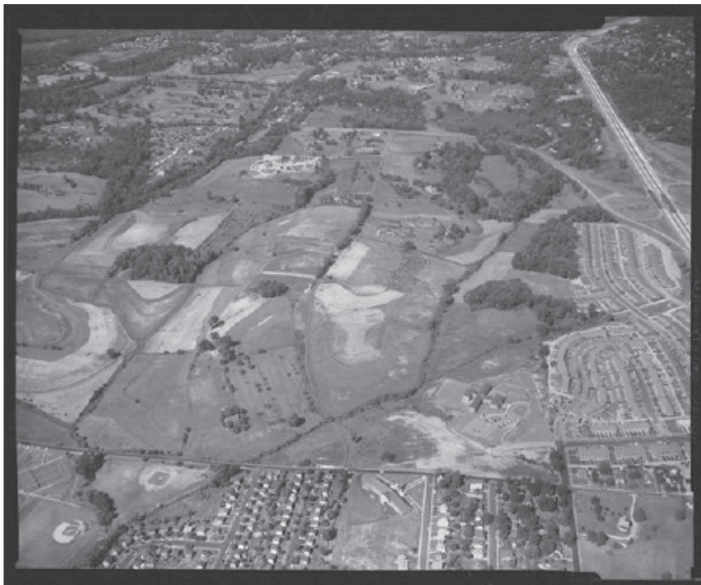
Aerial Photograph of UMBC Property Looking North from Arbutus, 1963. UARC 2007-02.

Later that night as my Dad was heading to bed,