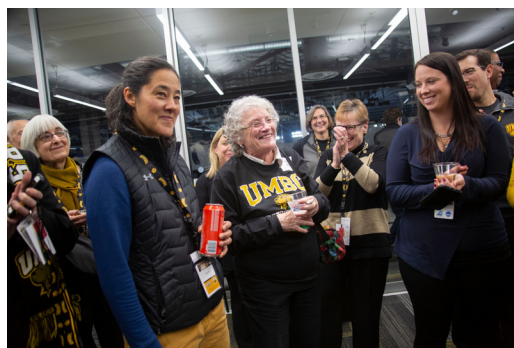
UMBC vs. Towson Basketball Game