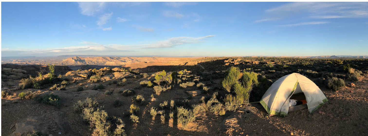
Campsite on Kaiparowits Plateau in Grand Staircase Escalante National Monument (GSENM) in southern Utah, April 2019.