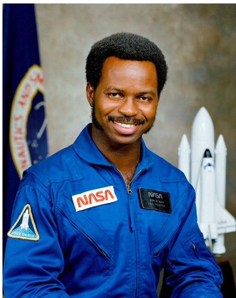
NASA Astronaut Dr. Ronald E. McNair (Ph.D.) was assigned as a mission specialist and was a crewmember on two Space Shuttle Missions. He first flew on STS 41-B in 1984 where he performed numerous science experiments. On his second flight, STS 51-L, Dr. McNair died on January 28, 1986 when the Space Shuttle Challenger exploded after launch from the Kennedy Space Center, Florida. S78-35300 (31 Jan 1978)

The National McNair Scholars Program is named for the late Dr. Ronald McNair, an African-American laser physicist who was a first generation college graduate and earned his doctorate at the age of 26 from M.I.T. He also was one of the astronauts who met his demise during the U.S. Challenger Space Shuttle disaster on January 28, 1986. UMBC’s Program has been in