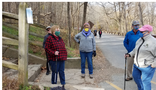
Hike Along the Patapsco