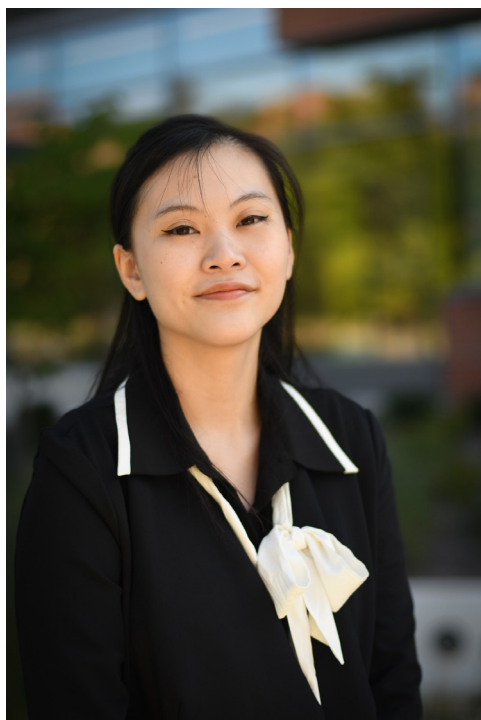
UMBC McNair Scholar, Ms. Ting Huang.

when distance learning became the only option available and to learn more about what works/does not work well in this learning format at the college level.