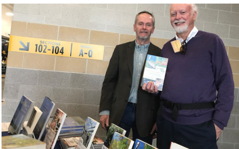
2019 Signature Event